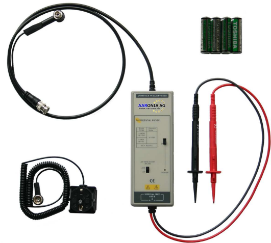
Included in delivery