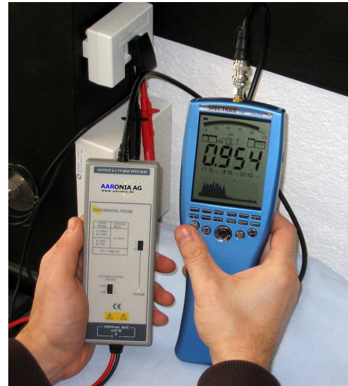
The ADP 1 used with the SPECTRAN NF-5030 for DSL measurements

Every Differential Probe goes through rigorous testing in our laboratories before shipment.